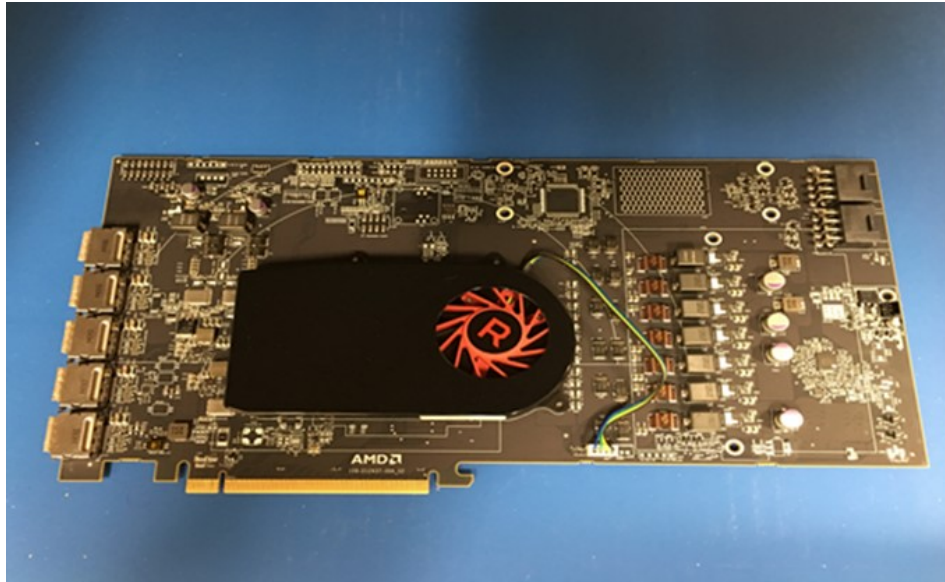
Figure 3: PCIe Development Board