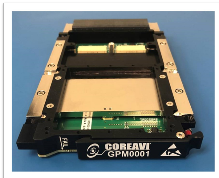
Figure 2: GPM0001 E9171-based COTS-D GPU-based Processor Module

The dedicated graphics memory is used by the GPU and graphics driver libraries to store the frame buffers (the OpenGL rendered images), Vertex Buffer Objects (VBO) and OpenGL textures (application data such as moving map data or decoded video streams).